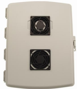
Vented Lid & Fan