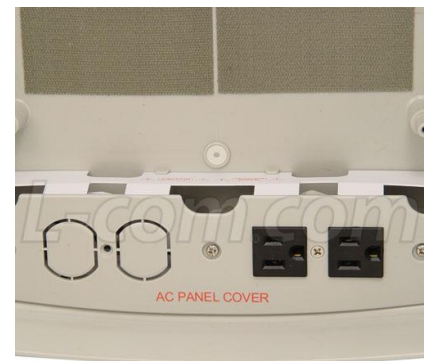
120VAC Power Panel