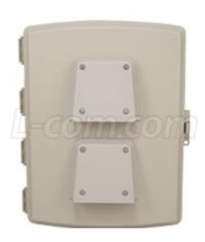
Vented Lid with Rain Shields in place